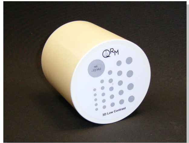
Contrast of -10 HU or -20 HU available!